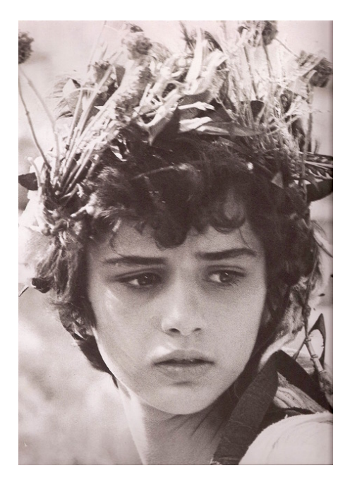
Fig. 5: Iphigenia's sacrifice