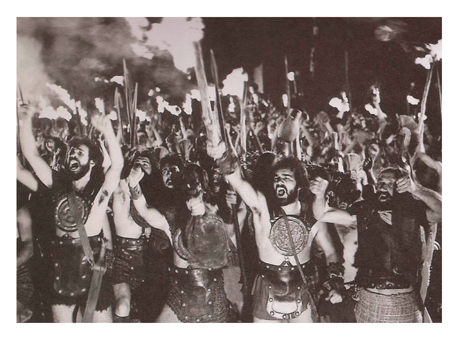
Fig. 4: The Greek Army demands they sail to war

maddened soldiers that long to sail to war (see Fig. 4).<sup>12</sup> In the film they are never long out of view rendering the unseen threat that the army represents in the play visible.<sup>13</sup> Agamemnon's anguished cry of ' \Delta \epsilon \mu \pi \circ \rho \omega , tíπotα δεν μπορώ!' (I can't, I can't do anything!) is rooted in his very real fear of the threat of the agitated mob he can barely control.<sup>14</sup> His ambition to lead the Greek army against Troy renders him powerless to do anything other than to submit to the will of the army, which is manipulated by the wily Odysseus.<sup>15</sup> In Cacoyannis' movie, when the army learns the truth about why Iphigenia was summoned to Aulis they volubly and enthusiastically support the sacrifice. In the film, Agamemnon's fears are therefore fully justified.