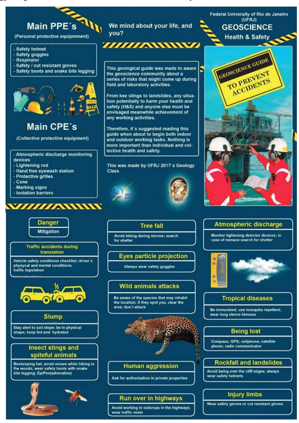
Figure 8 Geological Guide to Prevent Field Accidents, prepared by the first group of Health and Safety subject.