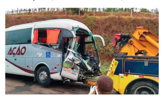
Figure 1 Photo of the front of the truck, that was destroyed in the accident involving students of the São Paulo University (G1 Sul de Minas, 2018).

• In August of 2018, occurred an accident involving a truck and a bus that transported students from the São Paulo University (USP) to a tournament (Figure 1). The accident was on the Fernão Dias highway in Minas Gerais, and left at least 15 students injured (G1 Sul de Minas, 2018).