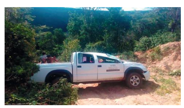
Figure 3 Photo of the vehicle that was taking the geology students by the time of the accident, with breakdowns due to the rollover (Várzea do Poço Notícias, 2017).