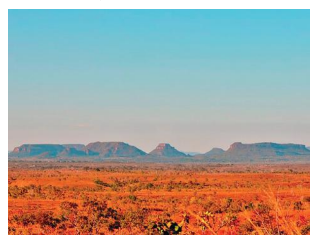
Figure 6 Region of Babaçulândia, extreme north of the state of Tocantins, where the student Yego Cunha Leal, disappeared and later, was found dead in 2013 (TV Anhanguera, 2013).

that the student died from dehydration, since it was very hot in the region (TV Anhanguera, 2013).