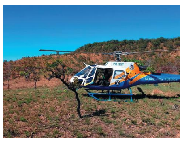
Figure 2 Photo of the rescue of the geology students, after being trapped in the Estrondo Range (G1 Tocantins, 2018).