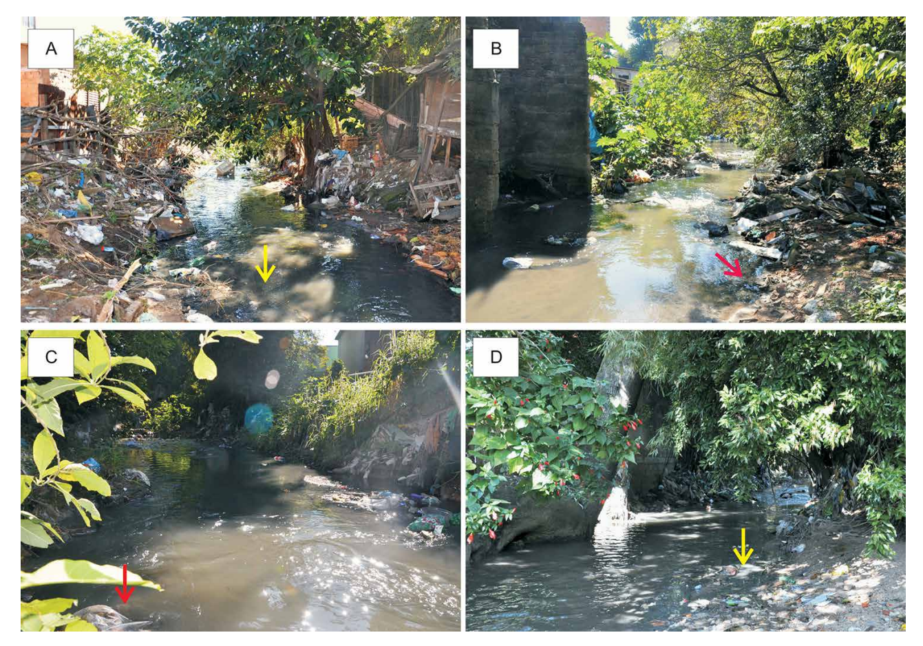
Figure 4 A. Accumulation of solid waste in the streambed and along the banks of the channel at Point 3 (P3), in the middle segment of the stream, north view of the channel (2012); B. Gray waters and accumulation of residues at P3, south view of the channel (2018); C. Solid waste accumulated on the banks of the channel, gray waters at the location of Point 4 (P4), close to the mouth, south view of the channel (2012); D. Gray waters and accumulation of residues on the banks of the channel at P4, north view of the channel (2018). Arrows indicate the sample collection locations.