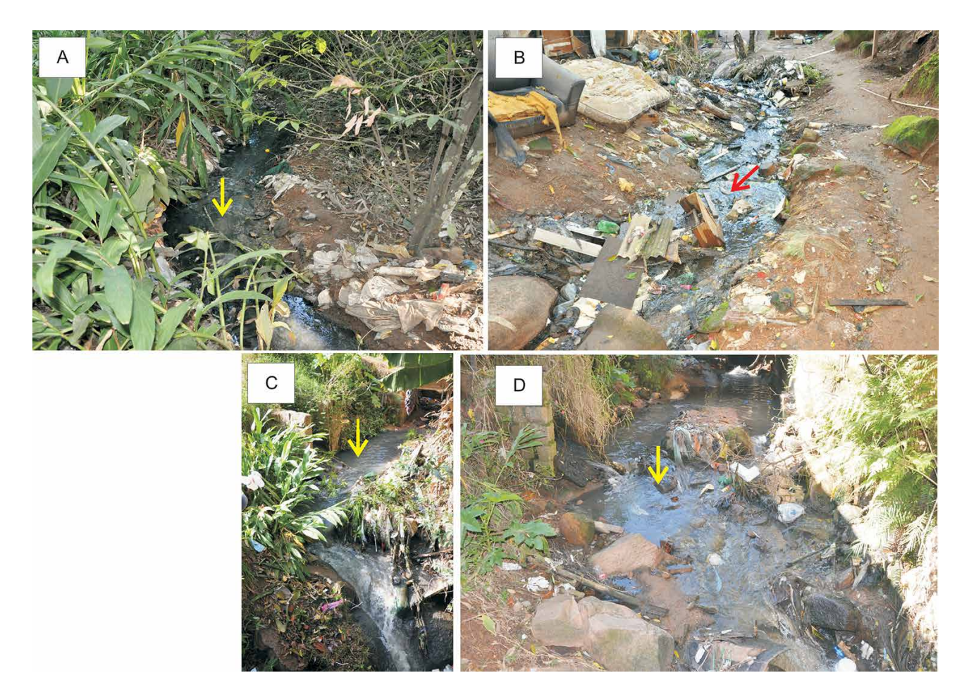
Figure 3 A. Gray water at the water collection site at Point 1 (P1), in the region near the springs, south view of the canal (2012); B. Material accumulated in the streambed and along the banks, dark gray colored water at P1, north view of the channel (2018); C. Location of Point 2 (P2), in the upper segment of the stream; south view of the canal (2012); D. Waste accumulated in the channel, dark gray colored water at P2, south view of the channel (2018). Arrows indicate the sample collection locations.

The capacity of a spring to retain metals is related to its bottom sediment's fine-grained fraction content. For this purpose, in Arroio Moinho, the granulometric analysis was performed on the samples using the wet sieving method (Suguio 1973). Part of the fine-grained fraction ( F_F < 0.062 mm, Wentworth granulometric scale) obtained through sieving, drying in an oven, and mechanical disaggregation, was analyzed by X-ray diffraction, by the procedures described by Alves (1987).