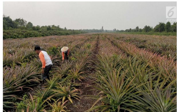
Figure 2 The farmers and his pineapple plantation.