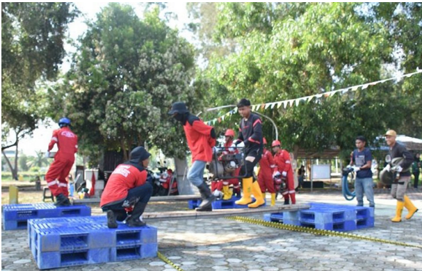
Figure 1 Firefighting training and competition between MPA groups.

(Forest and Land Fire Control Brigade of the Ministry of Environment and Forestry) Riau Province (see Figure 1). Communication between corporate, farmer groups and MPA groups plays a role in fire control. This collection of MPAs from several villages is known as the Fire Care Community Communication Forum. CSR communication by coordinating and mitigating fires succeeded in developing the innovation of Hydrant wells without fire engines.