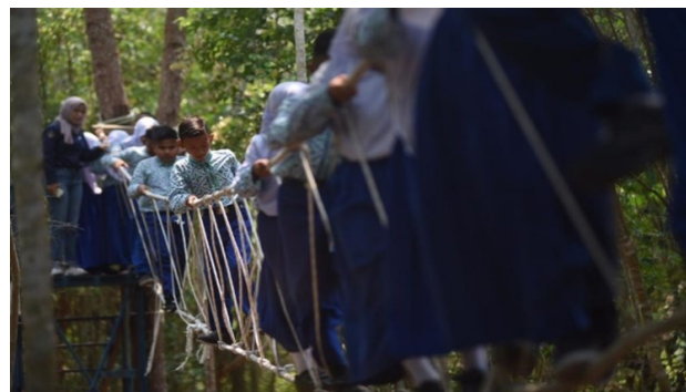
Figure 4 Some students play in the peat arboretum.