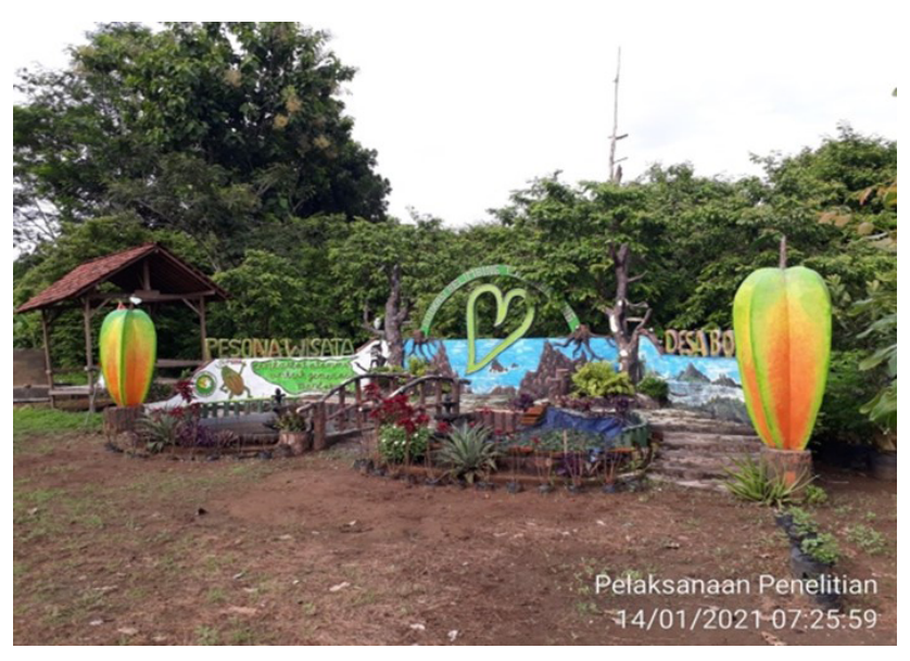
Figure 1 Research locations.