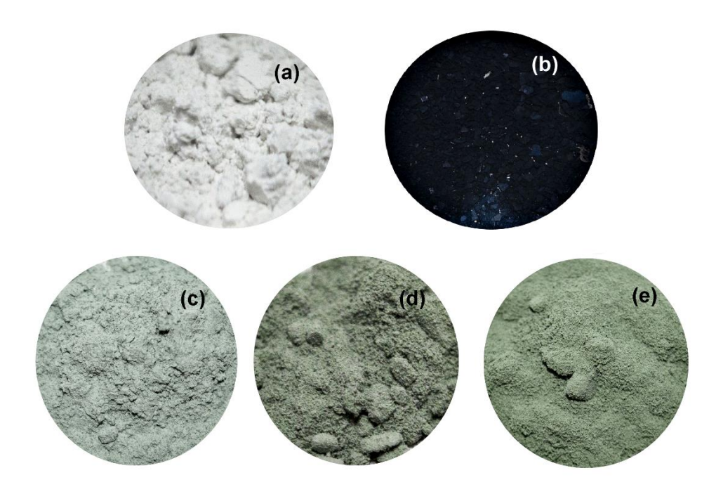
Figure 1. Geopolymer synthesized from 6 M phosphoric acid solution (a), polyaniline activated with 1 M phosphoric acid (b), and composites with 10% (c), 25% (d), and 50% (d) of polyaniline.

The samples were previously analyzed by thermogravimetric analysis, with the objective of identifying the loss of material mass as a function of temperature, as shown in Figure 2. In this case, degradation temperatures of the hydroxyls present in the materials are observed. Thus, it was possible to identify the evaporation of free water in the geopolymer (GeoB) at 113°C and for the composites it was observed the decrease of water evaporation temperature at 82°C, this can be attributed to endothermic events in which, the composites are absorbing heat and thus, performing the evaporation process. In this sense, increasing the amount of polyaniline in the matrix decreases the amount of water available in the reaction medium. Because an in situ polymerization is performed, the amount of reactants gradually increases, and the available water participates in the reaction (9).