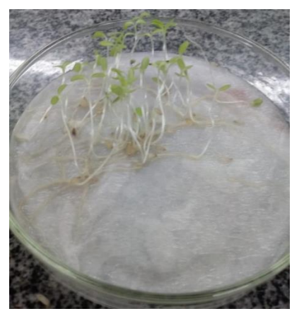
Figure 2. Illustration of experiments 1 (left) and 2 (right) of batch 3 of lettuce seeds ( Lactuca sativa L. Vitória de Santo Antão), twelve days after sowing.

As for the descriptive characteristics of experiment 1 of batch 3, the variability of the data, measured by the coefficient of variation (CV%), among the four characteristics evaluated, the one with the lowest dispersion was shoot height (SH) with CV=20, 30%, very high, and the one that presented the greatest was the root length (RL) with CV=28.11%, also very high, according to the classification proposed by Schmildt et al. (14). In the descriptive characteristics of experiment 2 of lot 3, the characteristic that had the lowest dispersion was the shoot height (SH) with CV=16.65%, very high, and the one that presented the greatest dispersion was the shoot height (RL) with CV=24.56%, high, according to Schmildt et al. (14) (Table 1). It can be seen that there is high variation when using 50 seeds in a petri dish, as Bulegon et al. (23), Paula et al. (24) and Souza et al. (25), this result occurs because the sample size interferes in the percentage and speed of germination of lettuce ( Lactuca Sativa L.) (14). Regarding the data normality test, only the root length characteristic, from experiment 1, does not present a normal distribution, according to the Shapiro-Wilk test (Table 1).