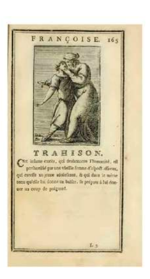
Fig. 4 - "Concorde", "Reconciliation" and "Trahison" J. B. Boudard. Iconolige, tirée de divers auterus ouvrage utile aux gens de lettres, aux poëtes, aux artistas & generalemente à tous les amaterus des beaux-arts, Chez Jean Thomas de Trattnem, Viena, 1759.

The images might suggest that the seed of treason is also present in the pact through its figurative similarity in the embrace and the configuration of the image; since both figures are necessary to understand the intended sense. It is likely that the original source was the Passion of Christ, which has been the model for Western treason (RIPA, 2002, p. 364–365; HERTEL, 1758, p.