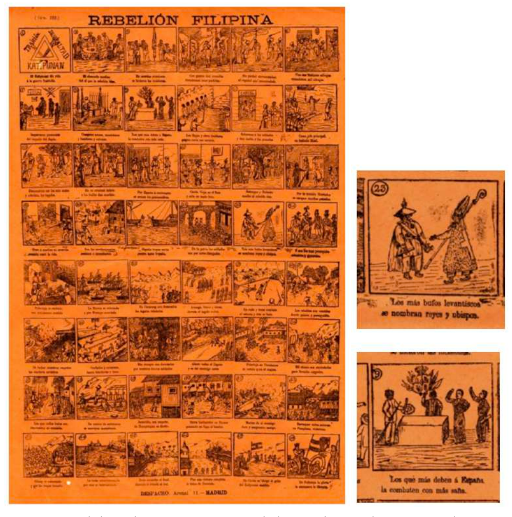
Fig. 1 - "La Rebelión Filipina", n. 122, auca, Madrid, Despacho Arenal 11, c. 1897 and 1898.

A milestone in the national history of the Philippines has been the facsimile reprint of the Antonio Morga's Spanish chronicle Sucesos de las Islas Filipinas annotated by Rizal in 1890. New historiographical tendencies have analyzed how Rizal's use of footnotes told a counter history of the Spanish conquest.<sup>3</sup> This conception only contemplates the footnotes within a historical dimension, that is, its study has been based on its adherence to the Ilustrado movement. (SCHUMACHER, 1991, BLANCO, 2009, p. 20; THOMAS, 2012).<sup>4</sup> However, Rizal's approach goes beyond commentary on the historical events narrated in the footnotes. His project is also semantic in nature and sought to destabilize, at least momentarily, the key concepts of the theological-political model of the Hispanic