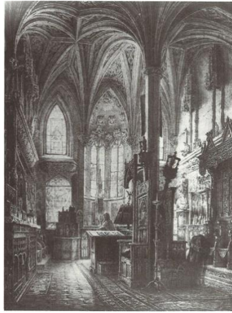
Fig. 2 – (BANN, 1990: 141)