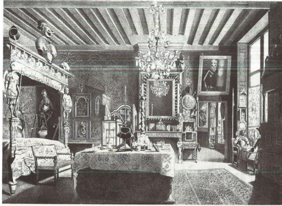
Fig. 1 - (BANN, 2010: 81)

the sixteenth-century monarch (See Fig. 1). According to Bann, François 1er’s room “is not simply a matter of monumental sculpture, as in Lenoir’s museum, but of the plethora of objects in domestic use: beds, coverlets, cabinets, chairs, tables and a host of other things too small to identify (but accessible to the visitor, who could peer at them and ponder over them to his heart’s content” (1990: 139). The visitor was not only viewing material history, he was also a part of it , being inside François 1er’s room.