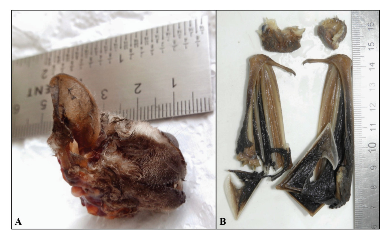
Figure 3 . Remaining parts of bats ( A. lituratus ) left by the cat after predation in the Natural History Museum of the Federal University of Alagoas (Alagoas State, Brazil) and found on the floor in the museum: head without occipital region (A) and wings plus the upper and lower dental parts (B).

None of bat species recorded in these attacks is currently listed for purposes of the National List of Threatened Species (ICMBio 2018). Both bat species are widespread in Brazil, though Phyllostomus. discolor had not yet been registered for the state of Alagoas (Reis et al. 2017). Artibeus lituratus and P. discolor are both found in artificial shelters, however, the former is most commonly found in treetops even in urban areas (Pacheco et al. 2010,