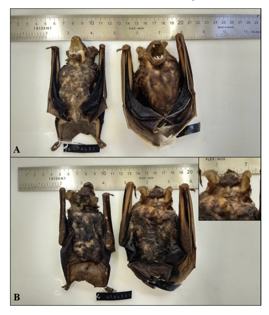
Figure 2. Entire rescued bats from a domestic cat attack in the Natural History Museum of the Federal University of Alagoas (Alagoas State, Brazil). Phyllostomus discolor (Voucher number: MUFAL0321, left) and Artibeus lituratus (Voucher number: MUFAL0157, right) preserved on liquid. Frontal (A) and dorsal (B) view, with detail of the injured nape of A. lituratus .

In total, five attacks were recorded from July 2014 to August 2015. The watchmen were able to rescue three entire bats: (i) an adult female of Artibeus lituratus (Olfer, 1818) on August 6<sup>th</sup> 2014 (Voucher number: MUFAL0157), (ii) an adult male of A. lituratus (Voucher number: MUFAL0158) on September 18<sup>th</sup> 2014 and (iii) an adult female of Phyllostomus discolor (Wagner, 1843) (Voucher number: MUFAL0321) on August 5<sup>th</sup> 2015 (Figure 2). These specimens had minor injuries close to the head, possibly where the cat gave its first bite. The remaining records are from: (iv) a head without