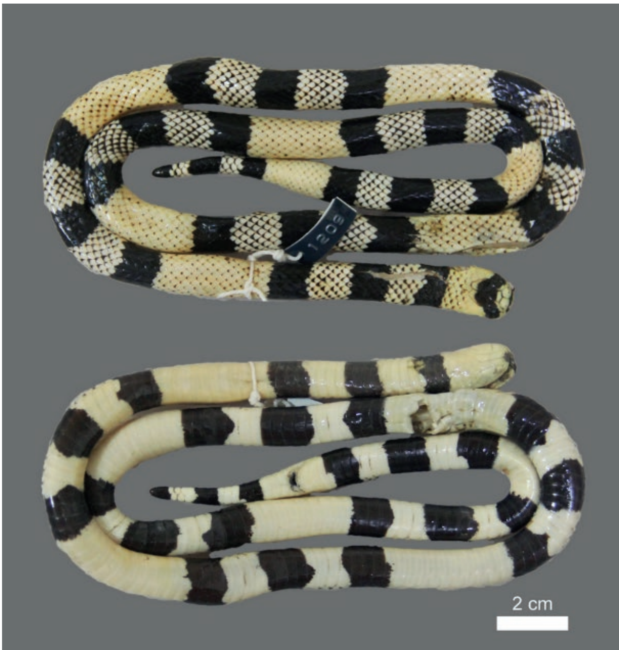
Figure 1. Specimen of Micrurus ibiboboca (MZUFV 1209) from Fazenda Limoeiro, Almenara, state of Minas Gerais, Brazil.

On 05 November 2019 MCN collected a specimen found dead on a dirt road within the Reserva Particular do Patrimônio Natural (RPPN) Mata do Passarinho (15°47'28" S, 40°31'34" W; ca. 665 m asl, datum WGS84) (field label MCN 434, to be deposited in the reptile collection of Universidade Federal de Juiz de Fora, Brazil). The specimen is an adult female; ventral plates 225; subcaudal plates in 22 pairs; body triads nine; tail triads one. The RPPN Mata do Passarinho is an Atlantic Forest protected area located on the