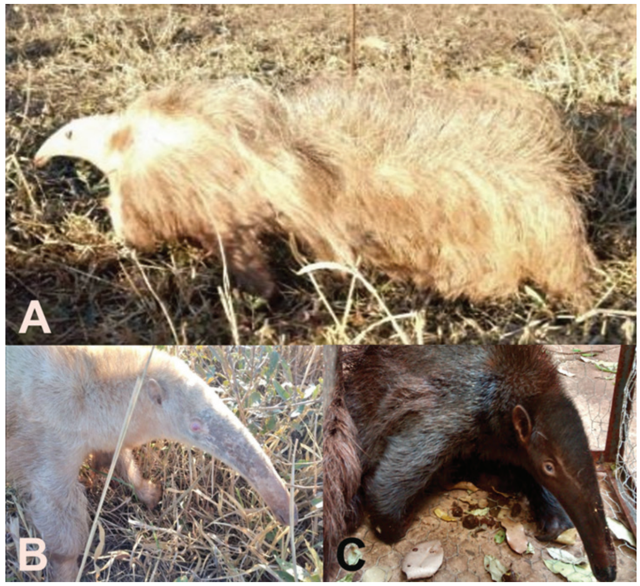
Figure 2. Albino (A, B) and melanistic (C) individuals of Myrmecophaga tridactyla (Pilosa, Myrmecophagidae).

of the rostrum, with its coloration being most evident in the mid-posterior portion of the head. The palpebral perimeter of the eyes and the helix of the ears of this individual are also light brown. The claws of the manus of this individual are pale black (Figure 2). The pes , in turn, could not be observed due to the position in which the animal is in the photographic record. The tail hairs of this individual are slightly lighter black than the rest of the body.