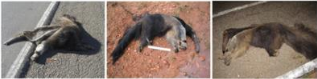
Family Myrmecophagidae, species Myrmecophaga tridactyla .