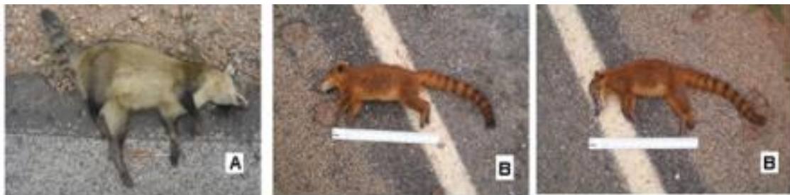
Family Procyonidae, species Procyon cancrivorus (A) and Nasua nasua (B).