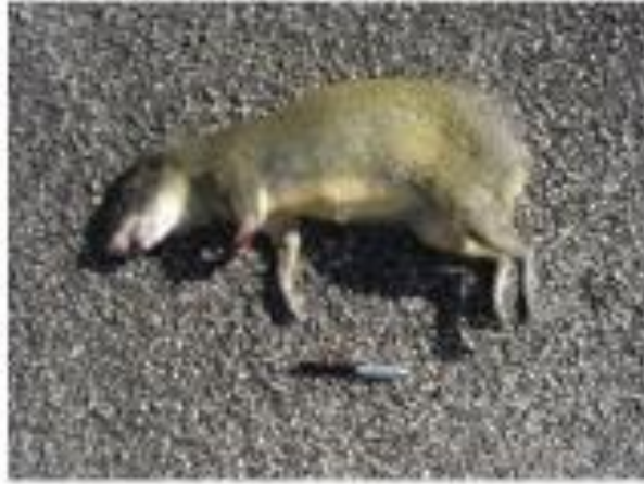
Family Dasyproctidae, species Dasyprocta leporina .