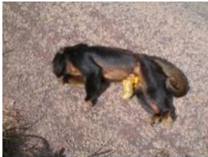
Family Cebidae, species Alouatta caraya .