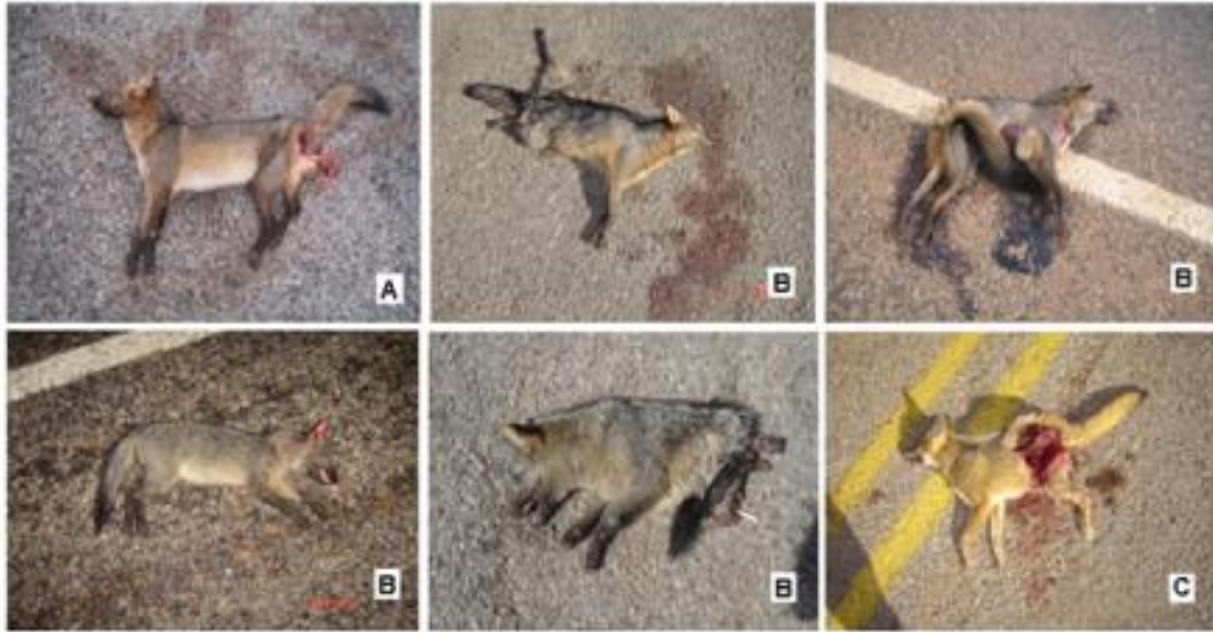
Family Canidae, species Chrysocyon brachyurus (A), Cerdocyon thous (B), and Lycalopex vetulus (C).