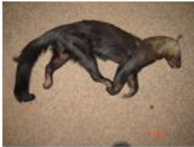
Family Mustelidae, species Eira barbara .