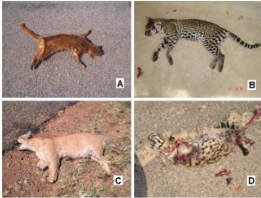
Family Felidae, species Puma yaguarondi (A), Leopardus pardalis . (B), Puma concolor (C), and Leopardus wiedii (D).