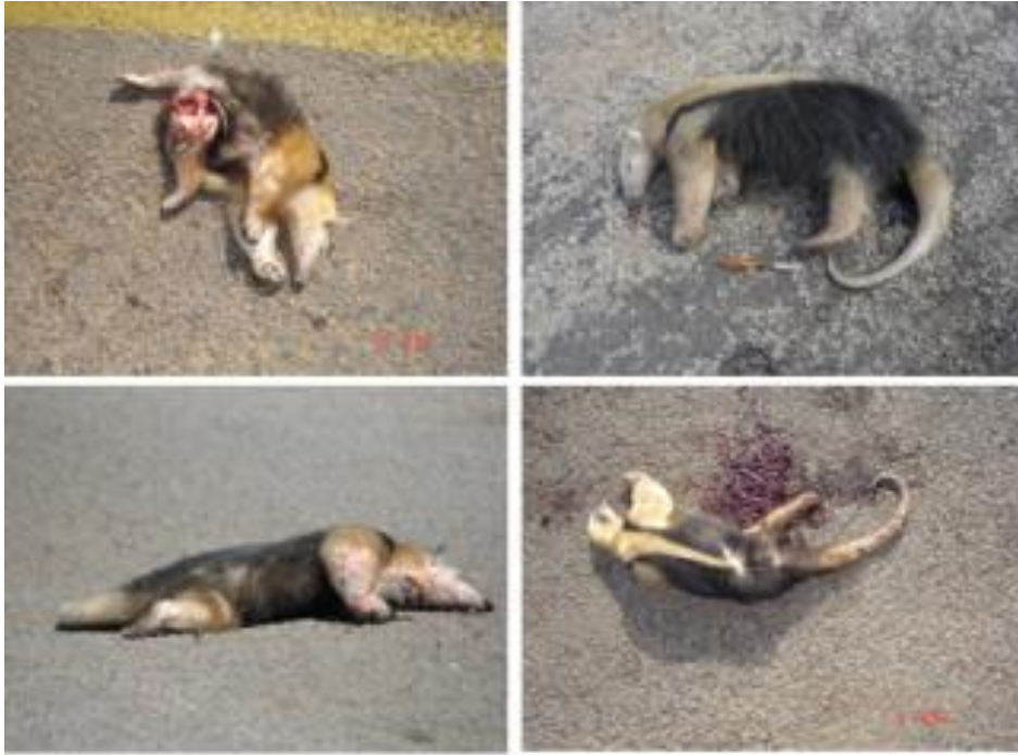
Family Myrmecophagidae, species Tamandua tetradactyla .