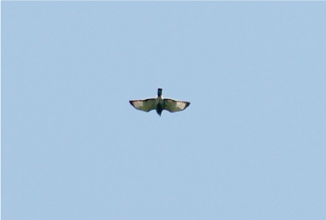
Figure 2. Buteo platypterus (Aves, Accipitridae) recorded in Campo Belo do Sul, Santa Catarina state, southern Brazil, December 10, 2012. Diagnostic characteristics visible in the photo: Buteo shape/silhouette; wings mainly white with well-marked dark/black edges; heavily marked brown body; and a broad white central band followed by a broad black band on the tail.