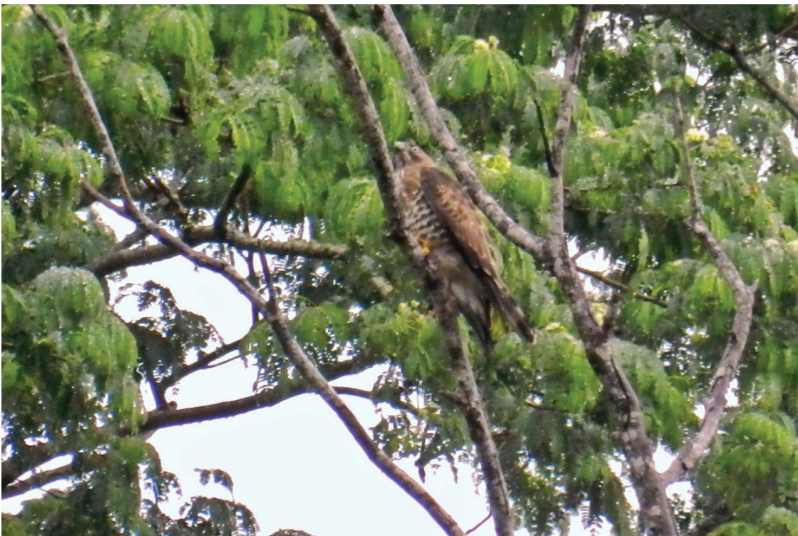
Figure 3. Buteo platypterus (Aves, Accipitridae) recorded in Santa Maria, Rio Grande do Sul state, southern Brazil, November 09, 2016. Diagnostic characteristics visible in the photo: dark brown back; brown chest (like a bib); white belly with evident dark bars; presence of a malar stripe; tail with a white tip, followed by a broad dark band and a white central band.