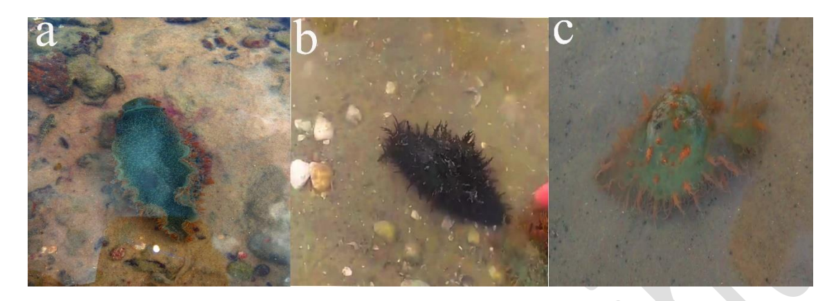
Figure 1. Bursatella leachii Blainville, 1817. a. Photographic records in the locality of Praia de Pirambúzios, Pirangi, Rio Grande do Norte. b. Record in the saline mangroves of the locality of Macau, Rio Grande do Norte. c. Record in the locality of Lagoa de Guaraíras, Rio Grande do Norte, Brazil.

Material examined: BRAZIL – Rio Grande do Norte, Nísia Floresta, Parrachos de Pirangi; 5°58'49.8"S, 35°06'32.2"W; 07.IX.1993; 9 specimens, UERN-Inv113; 6 specimens,