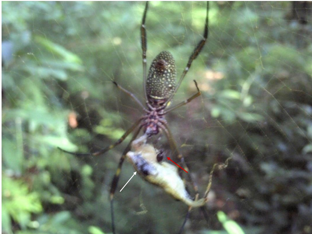
Figure 3. Photographic record of T. clavipes actively preying an amphibian in the municipality of Capão do Leão, state of Rio Grande do Sul, Brazil. The white arrow indicates the long and slender leg of the amphibian specimen, which was retracted and already in a state of decomposition. The red arrow indicates the kleptoparasite species. https://www.inaturalist.org/observations/234569826.

of long and slender legs, which were retracted and already in a state of decomposition, visible as the dark region on the animal's body (Figure 3).