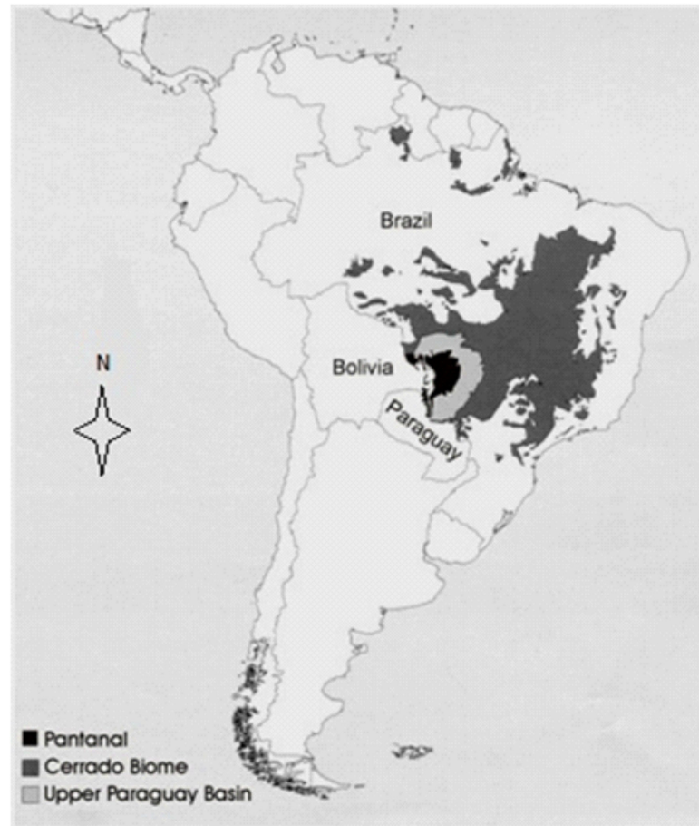
Figure 1. The Upper Paraguay River Basin showing (in dark black) in western Brazil the flatland which is the Pantanal, mainly in Brazil, but touching Bolivia to west and Paraguay to south, with influence of the Cerrado biome of central Brazilian territory.

Figura 1. Bacia do Alto Paraguai (em preto) na porção rebaixada do oeste do Brasil, que é o Pantanal, principalmente no Brasil, mas tocando a Bolívia na porção oeste e o Paraguai na porção sul, com influência do bioma Cerrado do Brasil Central.