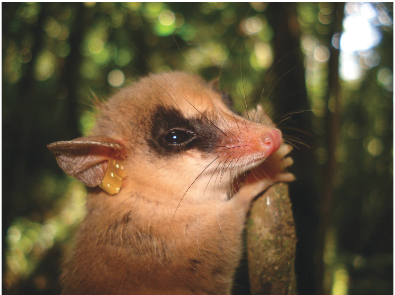
Figure 1. An individual of Gracilinanus microtarsus captured in this study.

Although recapture rates were generally high in other small mammal species present in the studied community (Barros et al. 2005b), we detected only two events of recapture of the 21 individuals of G. microtarsus captured, which is probably due to the arboreal habits of this species (Paglia et al. 2012). Both events occurred overnight. While one recapture was of an adult female within grid M1 and accounted for 56.6 m of distance moved at the dry season, the other movement at the end of the wet season was of exceptionally long distance. A sub-adult male of 11 grams moved between grids (from grid M2 to grid M1; Figure 2) within 24 hours. The short linear distance between the grids is 1.6 km, thus we considered 1.6 km the minimum distance moved by this animal in an overnight period.