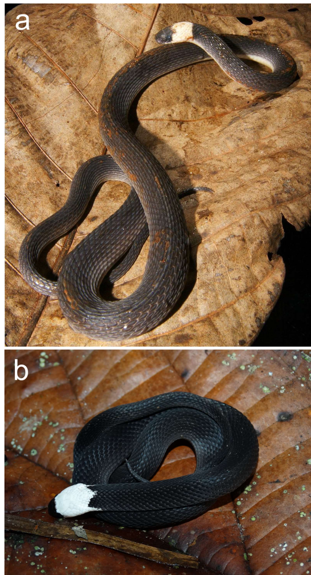
Figure 1. Live specimens of Ninia hudsoni from (a) Aripuanã, Mato Grosso, Brazil and (b) Assis Brasil, Acre, Brazil.

Our second record is from the municipality of Assis Brasil, in the state of Acre, Brazil. An adult specimen (Figure 1b) was found on February 10 th , 2016 during a herpetological survey in the Rio Acre Ecological Station. The snake was active at 8 pm above the leaf litter in an area of floodplain forest (-11.0239°, -70.2178°). This specimen was collected (license: ICMBio #48448-2) and deposited in the herpetological collection of the Universidade Federal Rural de Pernambuco (voucher number: CHPUFRPE 4425).