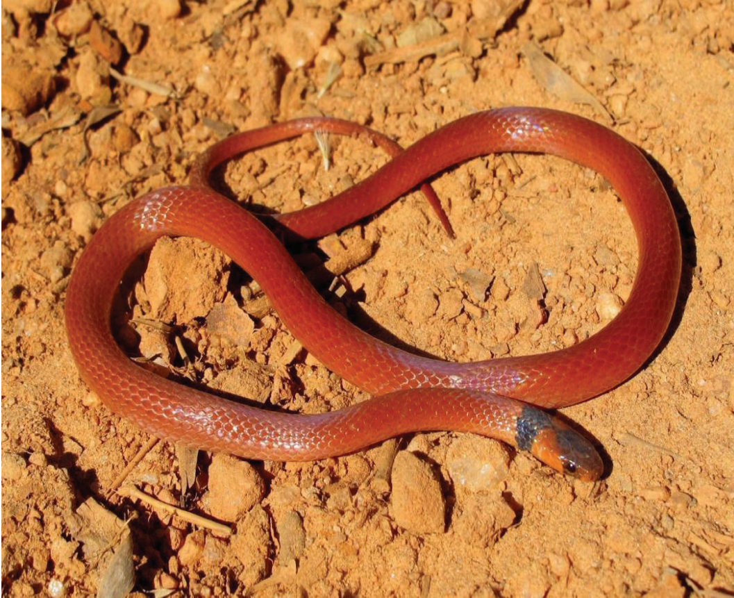
Figure 1. Live specimen of Tantilla boipiranga from the municipality of Morro do Pilar, Minas Gerais, Brazil.

de Minas Gerais (MCNR). Specimens were morphologically analyzed by the characters proposed by Sawaya & Sazima (2003), and Silveira et al. (2009) (Table 1). Measurements of the body were taken with a measuring ruler (1 mm precision) for total length, and a digital caliper (0.02 mm precision) for head length, head width, interocular distance, and internasal distance. The specimen mentioned by Nogueira et al. (2020) for the locality of Caratinga - MG (UFMG 1402), was also examined and we update its voucher number to UFMG 121. In addition to the analyzed specimens, we compared them with two paratypes of the species housed at the UFMG collection, which were formally cited by Sawaya & Sazima (2003) as UFMG 1034 and 1048. However, due to a reformulation in the collection, these specimens had their vouchers changed to UFMG 123 and 124 respectively (Table 1).