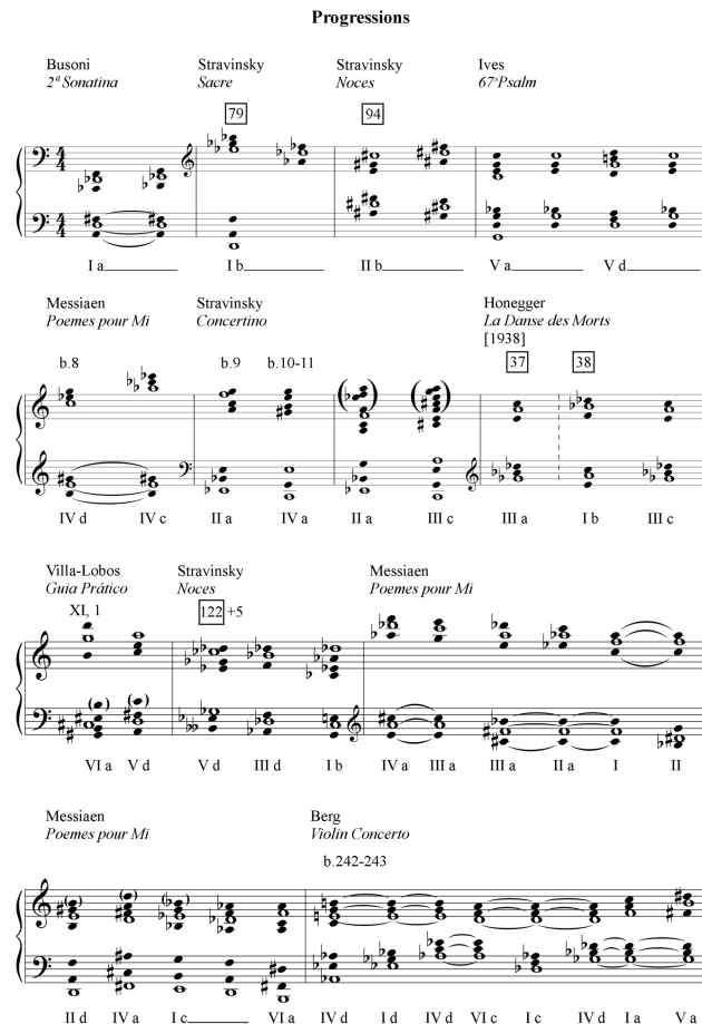
Example 14 – “2-Keys” Accords : examples of “P.H.” progressions

use by Milhaud, notably in the Choephores (see the “Libation” scene illustrated in example 16), of progressions consisting of a same “2-Keys” Accord in which the roots are interchangeable via chordal inversion 39 , a procedure which can also be found in works of other Milhaud contemporaries (see on example 14 quotations from Busoni, Stravinsky, and Ives). Other examples (by no means exhaustive) are presented in example 14, such as: one same Accord articulated over different roots (as in the example of Busoni’s Sonatina ); different Accords over different roots (as in the example of Stravinsky’s Concertino ), either in one same “mode” throughout ( manière “a” in Messiaen’s “Action de Grace” example) or many and mixed manières (as in Messiaen’s “Épouvante”).