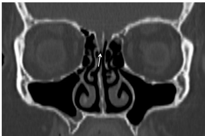
Figure 2: CT of paranasal sinuses in coronal incidence showing an inferior positioning of the cribriform plate of the ethmoid bone (arrow) in the right side in comparison with the left side. Surgical procedure confirmed the presence of a meningoencephalocele.

until this point. She described this symptom as refractory to conservative approaches for rhinosinusitis. Associated symptoms included remittent headaches, hypoacusis, and gait unsteadiness. She denied previous head trauma. CT of paranasal sinuses revealed indirect signs of CSF fistula (Figure 2). Nasofibroscope without fluorescein was normal. Analysis of rhinorrhea fluid showed presence of glucose, compatible with CSF.