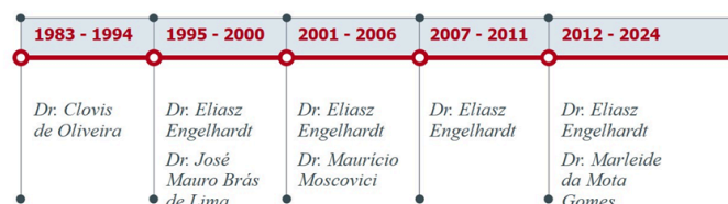
Figure 02: Names and periods of service as Editors-in-Chief in the Revista Brasileira de Neurologia (1983-2024). Source: Library of Institute of Neurology Deolindo Couto.