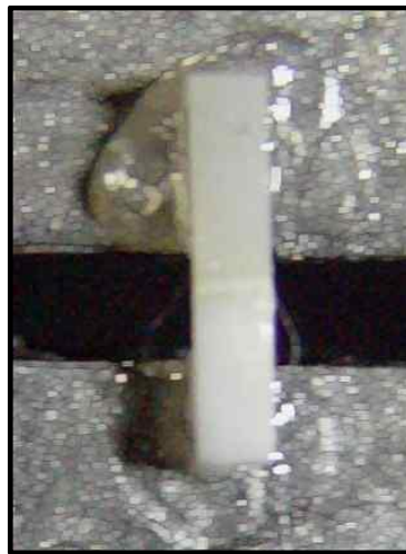
Figure 2: Sticks obtained from the teeth/restoration resin interface cuts attached to the microtensile holder.

The restored specimens were fixed on acrylic plates with sticky wax and submitted to a precision metallographic machine cut (Isomet 1000, Buehler Ltd., Lake Bluff, IL, USA), which ensured precisely sectioning. The cuts were accomplished under cooling with water, in the vestibule-lingual direction, which provided 1.0 mm thick slices (Figure 2). After the initial procedure, new cuts were made perpendicular to the first cut, to obtain ~10 mm longer stick-shaped samples with a square cross-sectional area of about 1 mm 2 . Each one of 18 teeth furnished 10 sticks, which resulted in total of 60 samples per adhesive type. Each stick was fixed to the microtensile device with cyanoacrylate adhesive (Super Bonder, Loctite, São Paulo, Brazil), and the set (specimen + device) was attached to a universal testing machine (EZ Test, Shimadzu Co., Kyoto, Japan). A perpendicular traction force was applied to the interface at a speed of 0.5 mm min -1 until the fracture was detected.