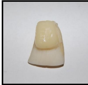
Figure 1: Resin-composite block adhered to the upper treated tooth surface.